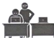
Solving Problem Together