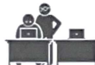
Solving Problem Together